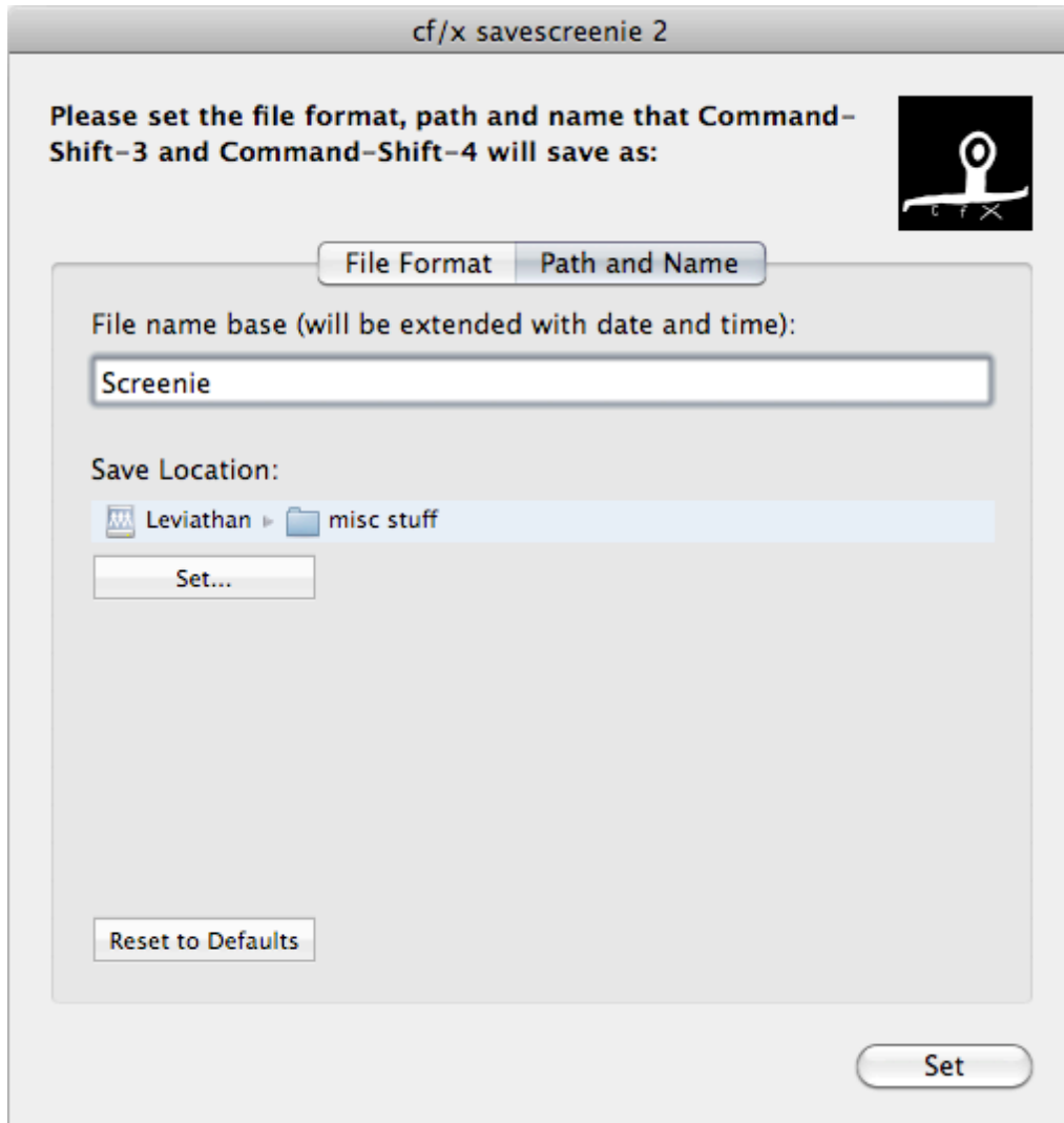
Figure 2 : savescreenie's Path and Name tab

To change the location where OSX should save your screenshots, press the 'Path and Name' tab.